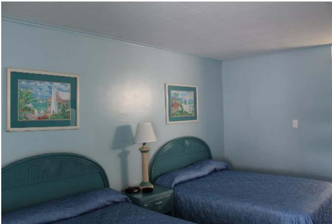
Figure 2.19 Typical room in the Waikiki Village Motel.