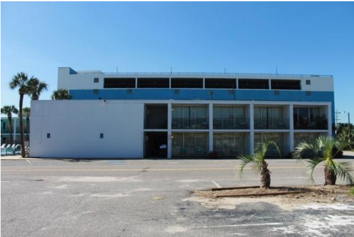
Figure 2.6 North elevation, 1967-1969 addition.