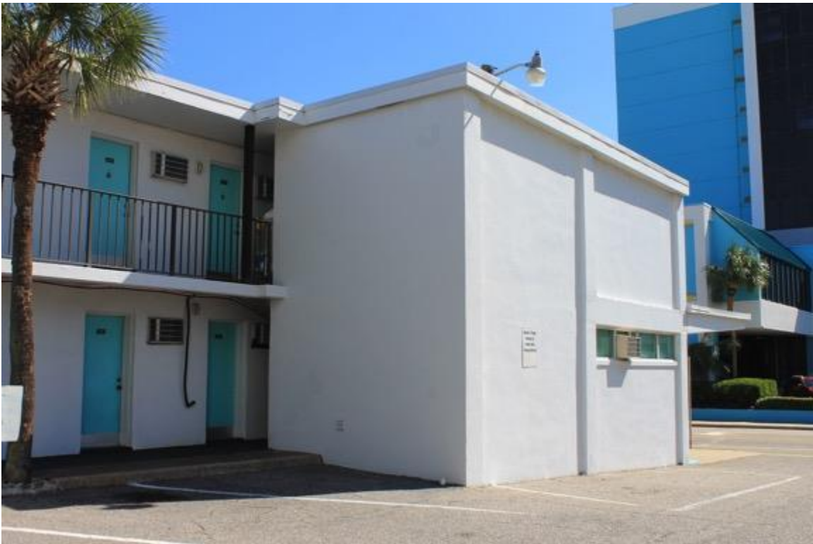
Figure 2.12 South elevation of front office.