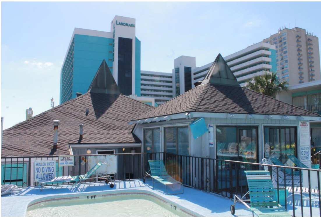
Figure 2.17 Sliding doors on additional hut.