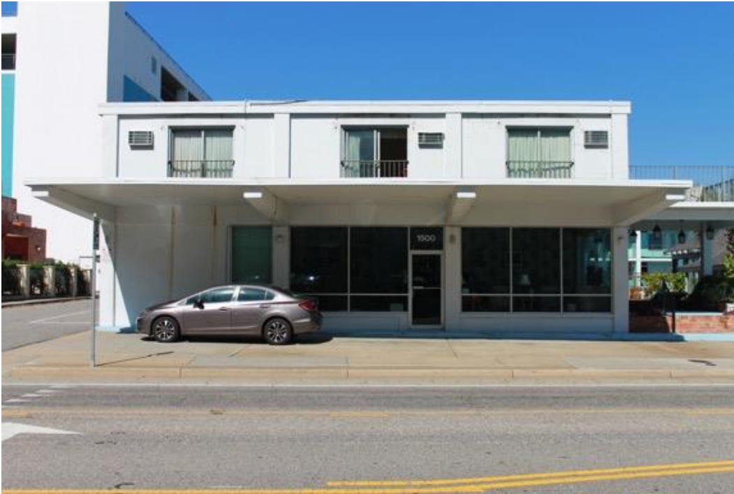
Figure 2.2 South end of east elevation, front office.