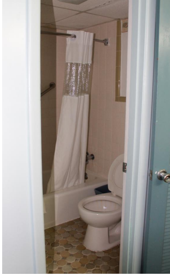
Figure B.6 Standard bathroom in Waikiki Village Motel.