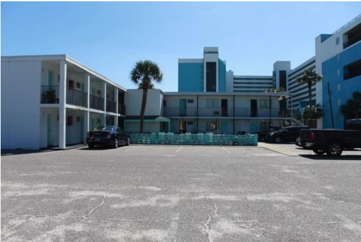
Figure 2.8 West elevation of original structure.