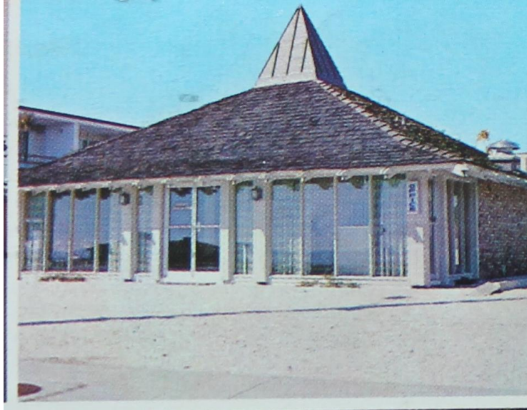
Figure 2.26 Original Hawaiian-style hut entrance.