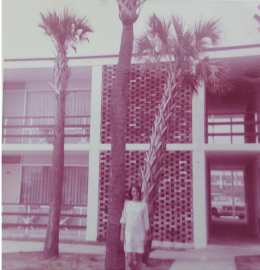
Figure 2.29 Brick lattice wall.