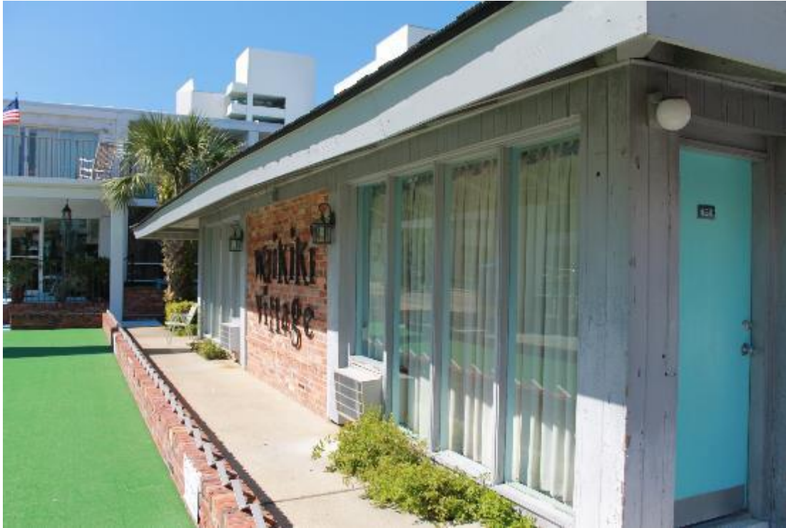
Figure 2.16 Detail of Hawaiian-style hut, looking south.