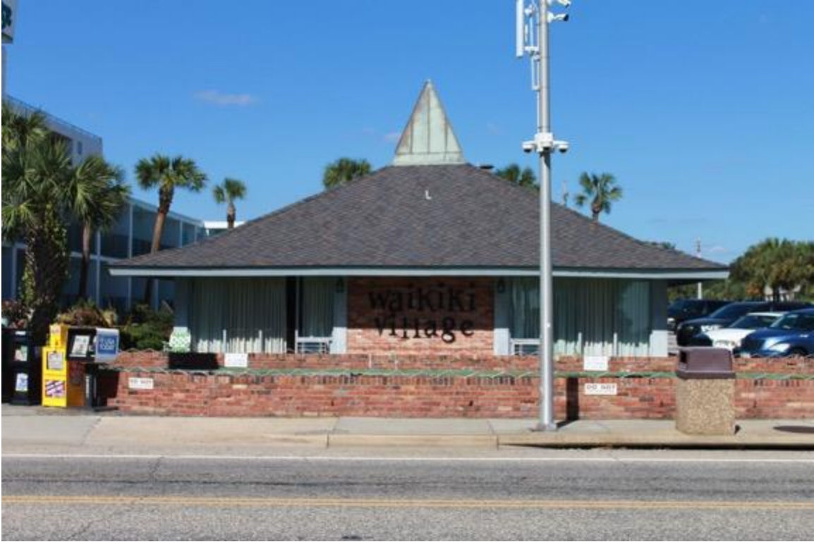
Figure 2.13 East façade, Hawaiian-style hut.