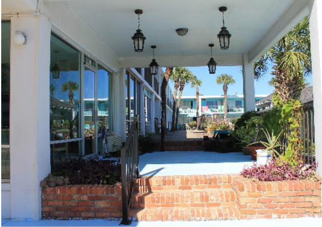
Figure 2.28 Covered patio, looking west.