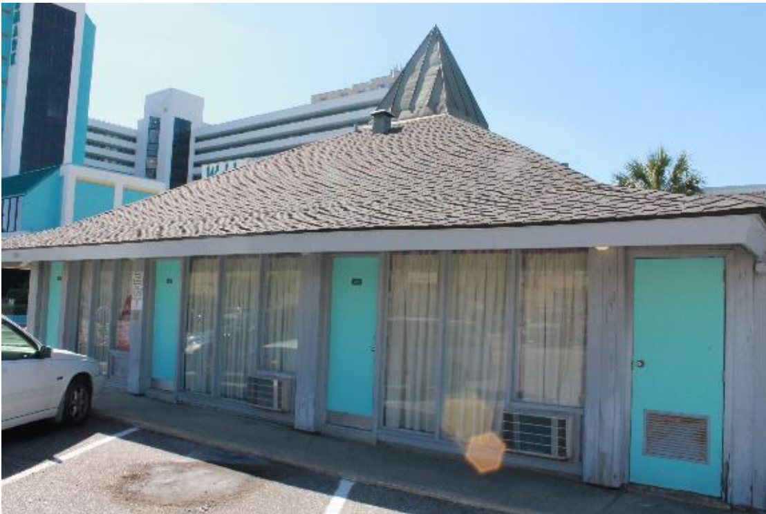
Figure 2.14 North elevation of Hawaiian-style hut.