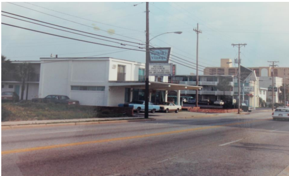
Figure 2.30 Original location of sign.