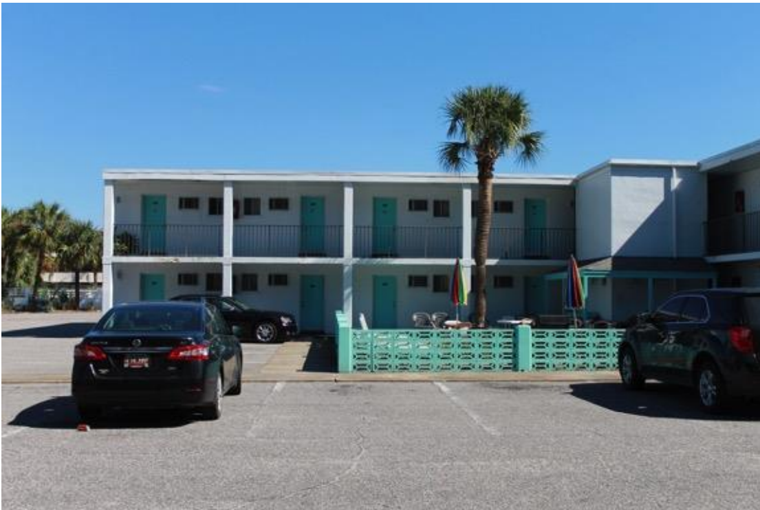
Figure 2.10 South elevation of 1967-1969 addition.