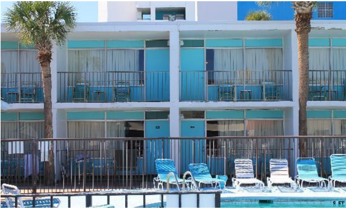
Figure 2.4 Reflectional symmetry of guest rooms, north elevation.