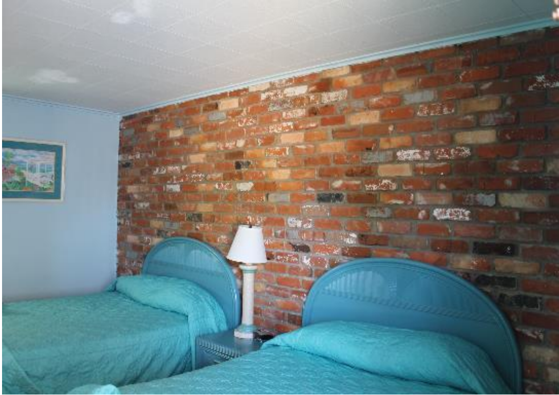
Figure 2.20 Exposed brick wall in Room 134.