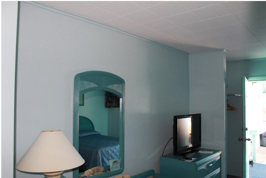
Figure B.3 Current sheetrock wall.