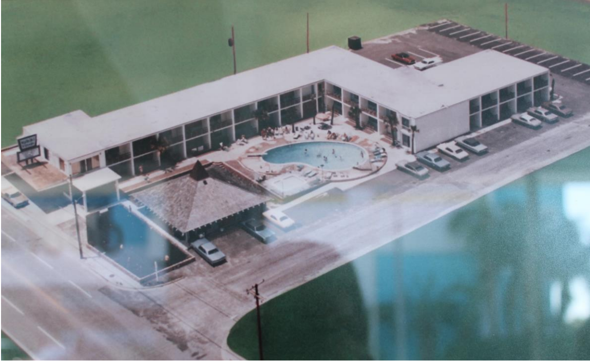
Figure B.1 Waikiki Village after 1967-1969 addition.