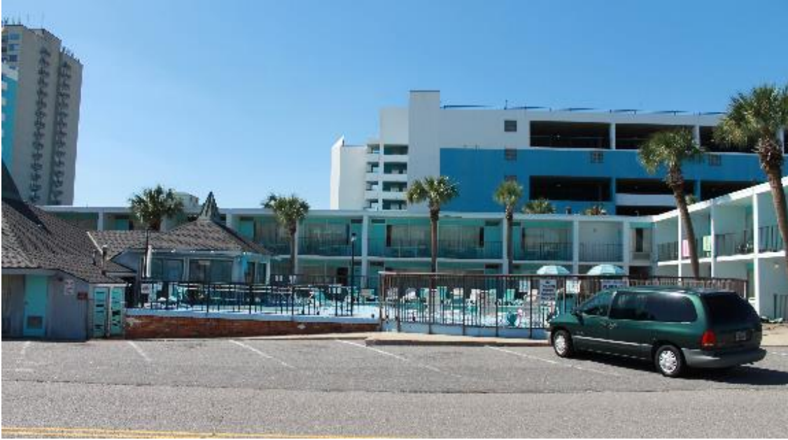
Figure 2.3 North elevation of motel with pool and hut addition.