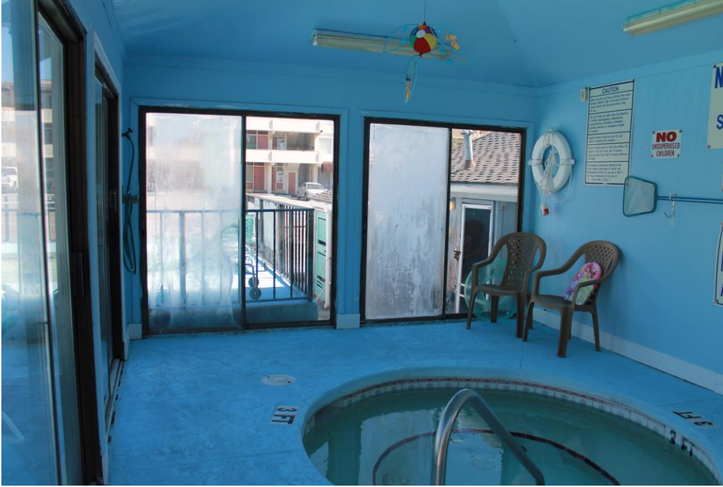
Figure B.7 Indoor hot tub, smaller Hawaiian-style hut.