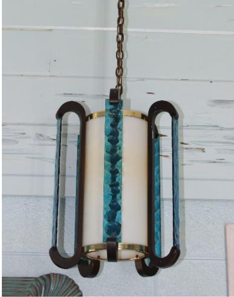
Figure 2.24 Original light fixture in Hawaiian-style hut.