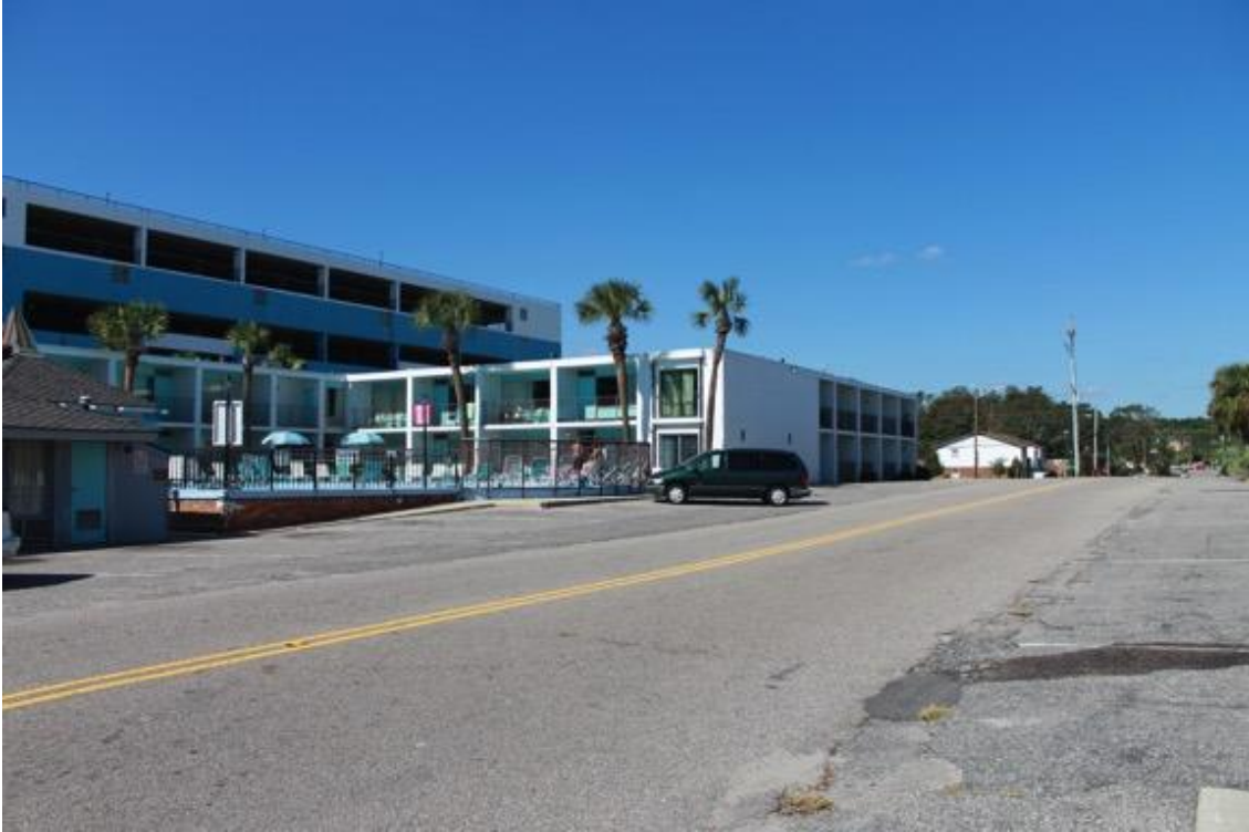
Figure 2.5 East elevation with addition projecting west.