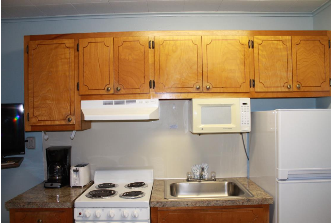
Figure B.4 Standard kitchen in Waikiki room.