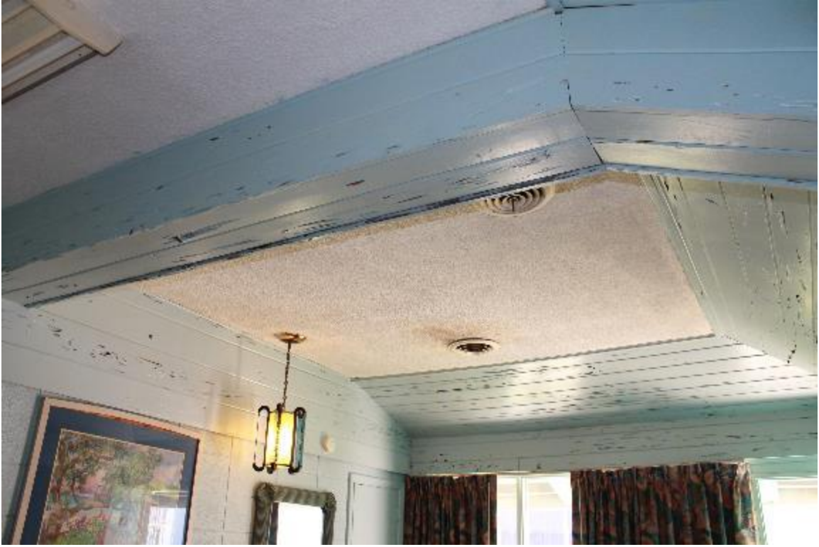
Figure 2.22 Pecky Cypress ceiling framing in Hawaiian-style hut.