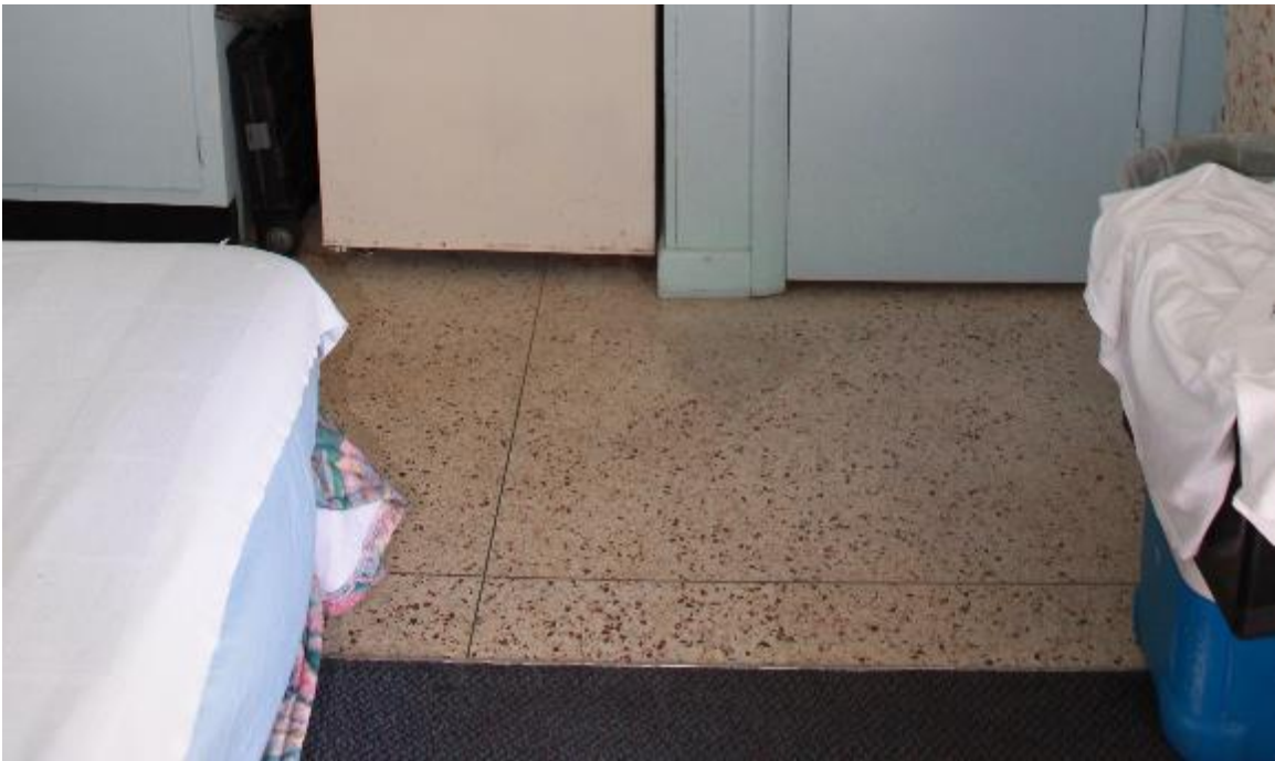
Figure 2.23 Terrazzo flooring in Room 402.