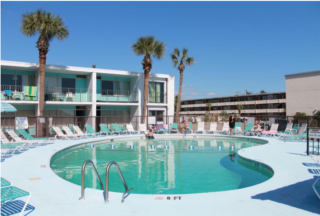
Figure B.8 Boomerang shaped pool. (Photo by the author.)