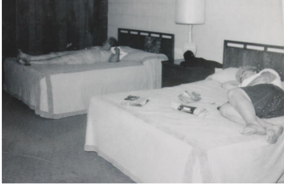
Figure B.2 Original exposed cinderblock walls.