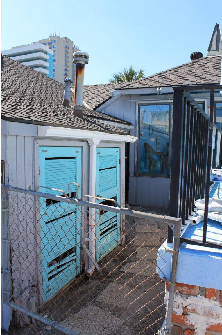
Figure 2.15 Shed addition on hut for pool equipment.