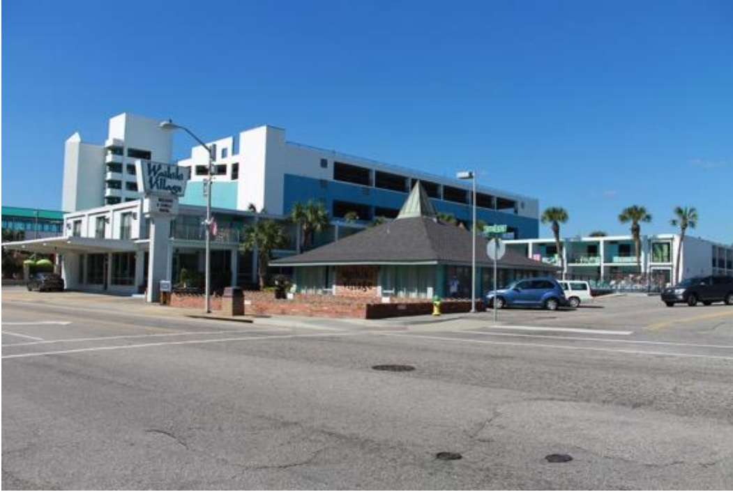
Figure 2.1 Northeast oblique of Waikiki Village Motel.