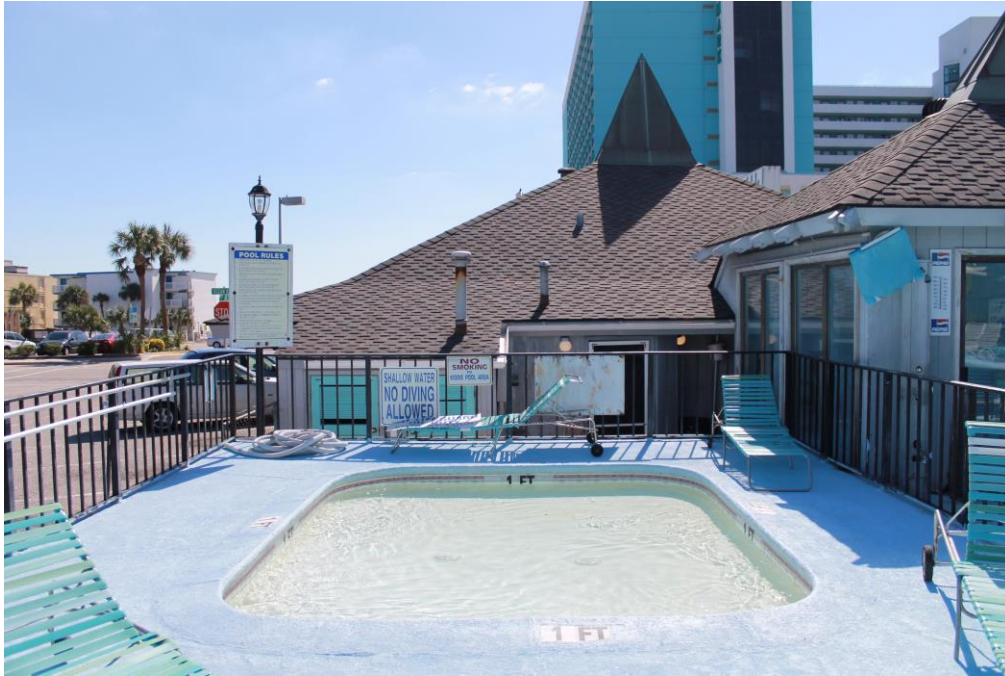
Figure B.9 Kiddie pool.