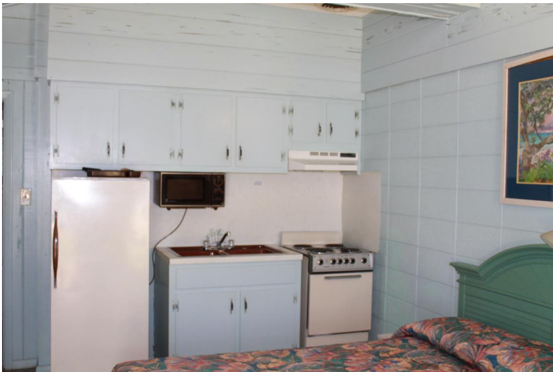
Figure B.5 Efficiency room in Hawaiian-style hut.