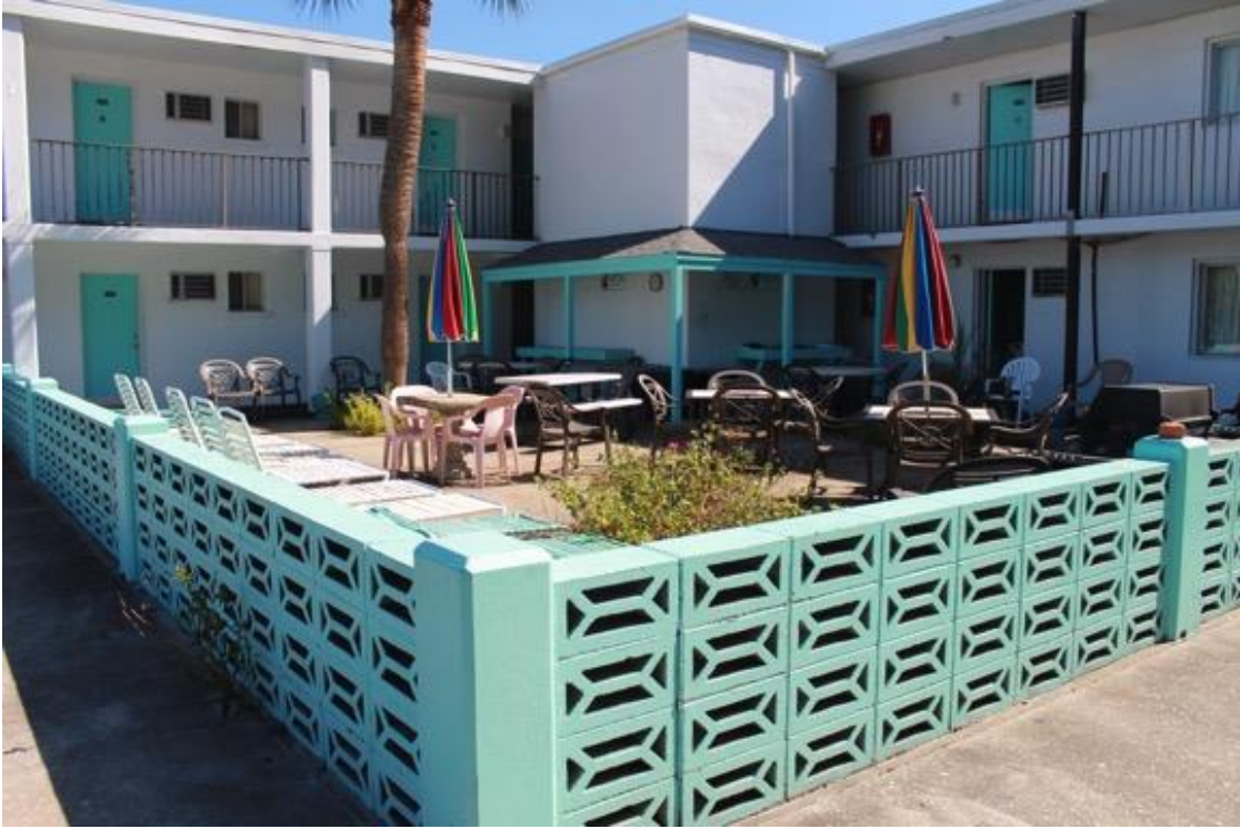
Figure 2.9 Cinderblock enclosed patio with cookout station, northeast oblique.