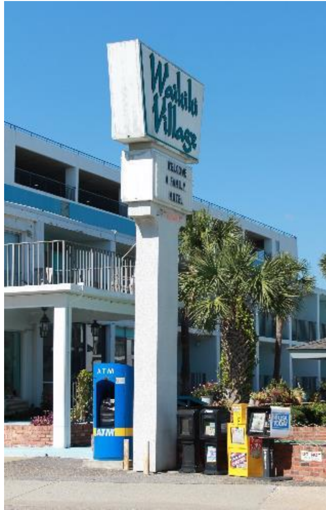
Figure 2.31 Current Waikiki Village sign.