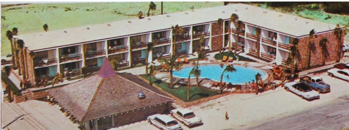
Figure 2.25 Original design and red brick finish of Waikiki Village Motel, circa 1963.