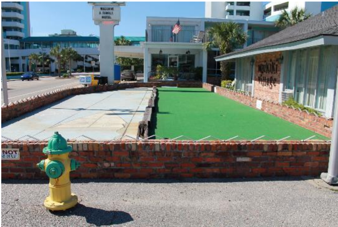
Figure 2.27 Putting green and shuffleboard deck.