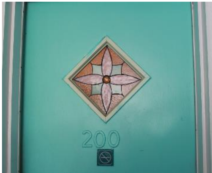
Figure 2.21 Stained glass window, Room 200.