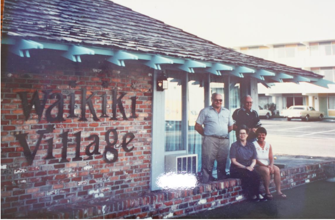
Figure 2.32 Original exposed rafter tails.