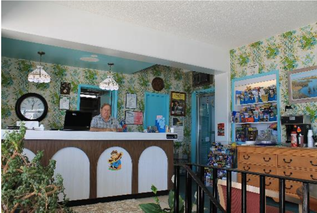
Figure 2.18 Front desk in lobby.