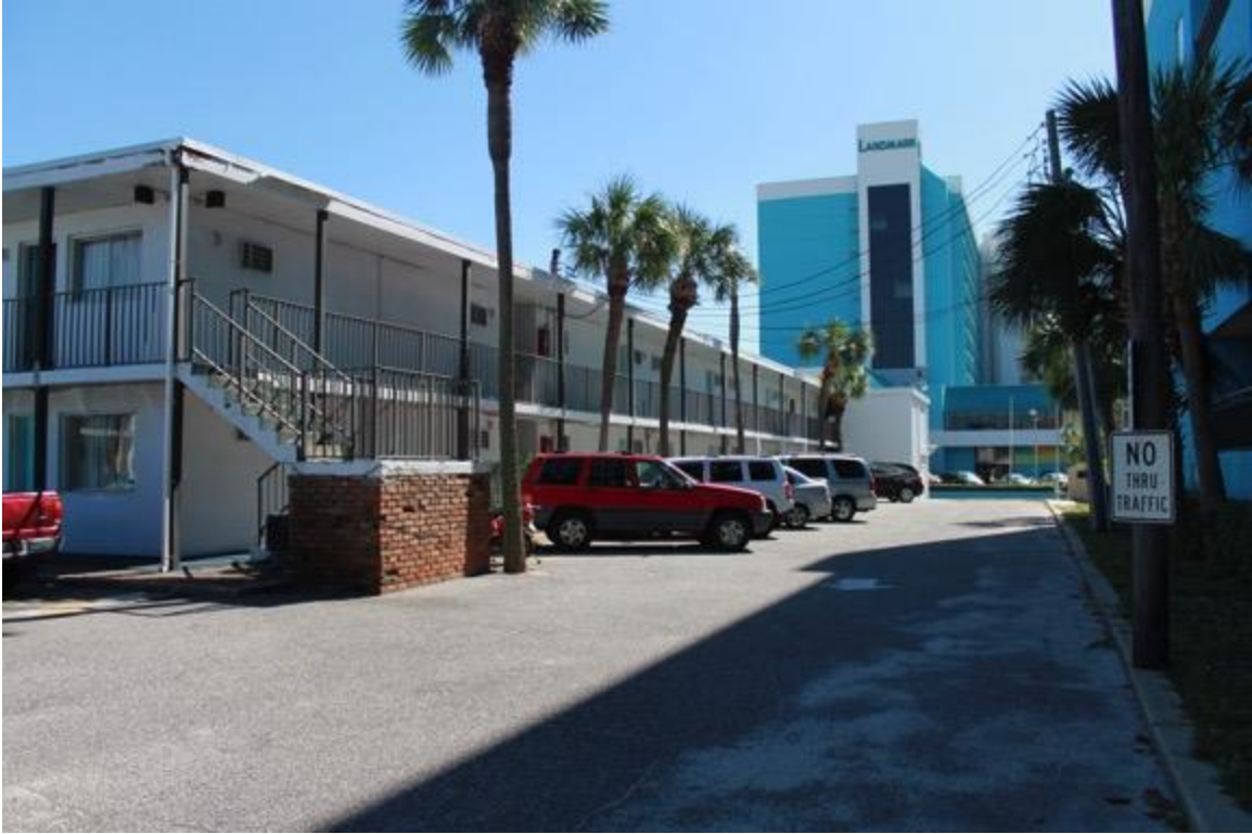
Figure 2.11 South elevation, original structure.