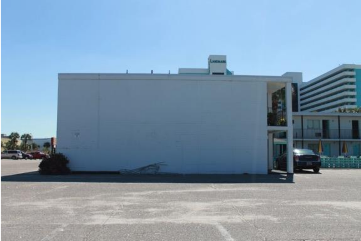
Figure 2.7 West elevation, 1967-1969 addition.